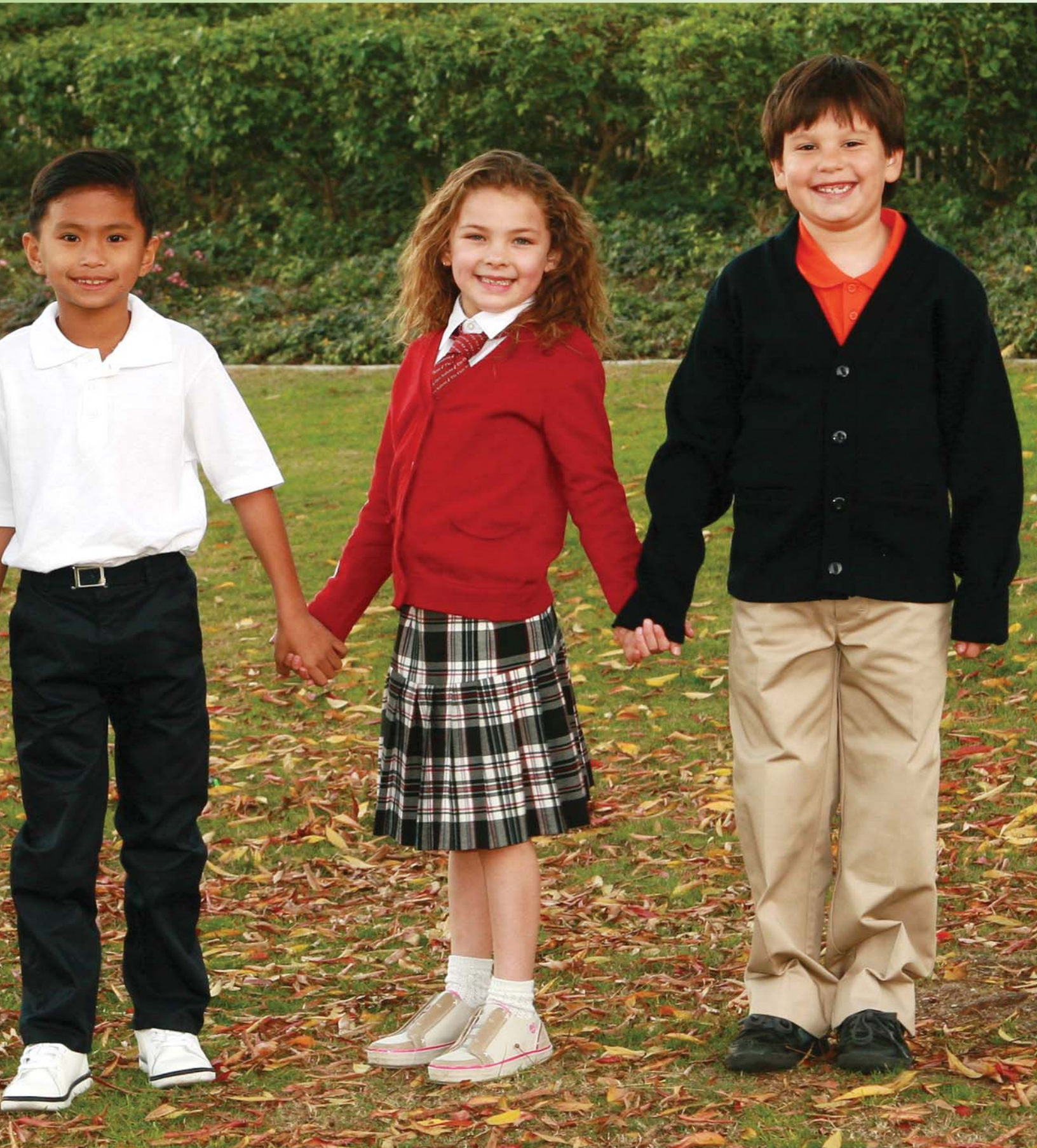
From left to right: Outfit by French Toast tights by Country Kids, Outfit by Carter's "Watch the Wear" shoes by Polo Outfit by Create Your Uniform shoes by Timberland, Outfit by Classroom School Uniform

Jj Kk Ll Mm Nn Oo Pp Qq Rr Ss Tt Uu Vv Ww Xx Yy Zz