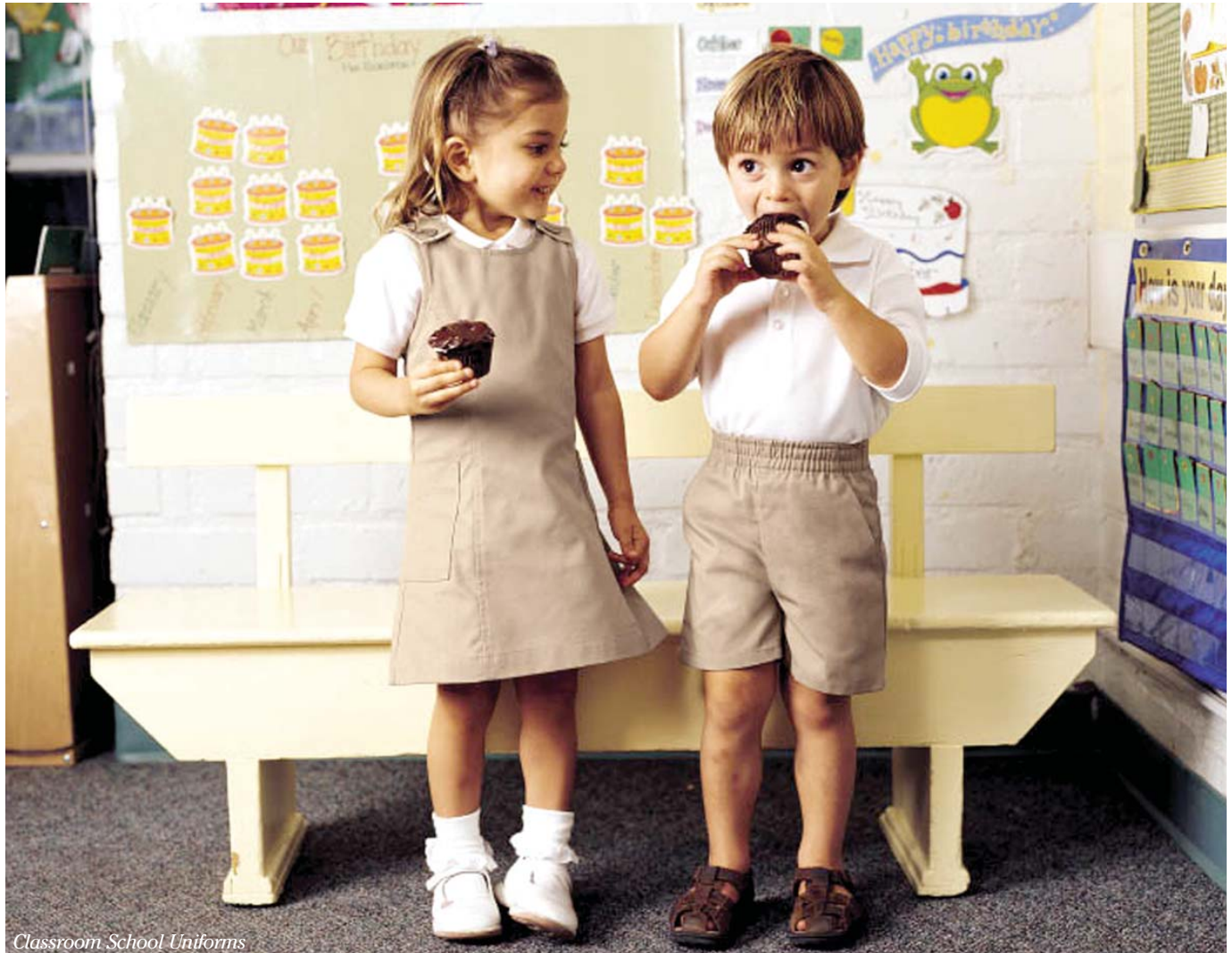
Classroom School Uniforms

With several states starting school years earlier than the traditional after-Labor-Day date, some as early as July, pressure from parents has pushed for legislation to limit how early school may begin. School boards are resisting, trying to maintain local control of their calendars and create more time to prepare students before state-mandated testing occurs. The tourism industry at large has joined the push for a change to later start dates citing lost income and a lack of student workers after school starts.